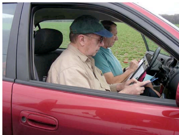
At Speed April 2009