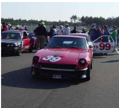
At Speed April 2009